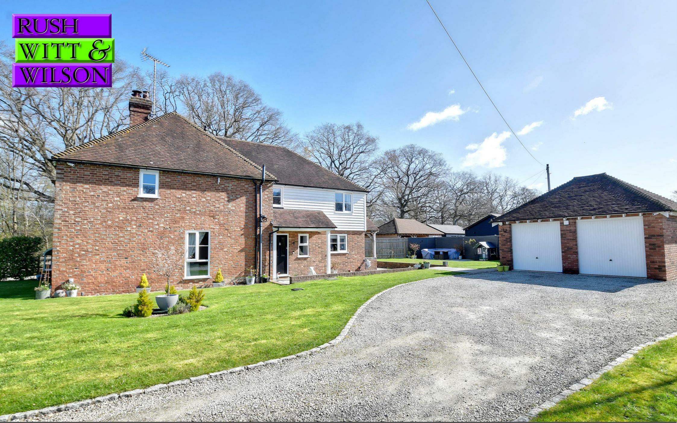
Beulah, Harris Lane, High Halden, Kent TN26 3HN Guide Price £895,000